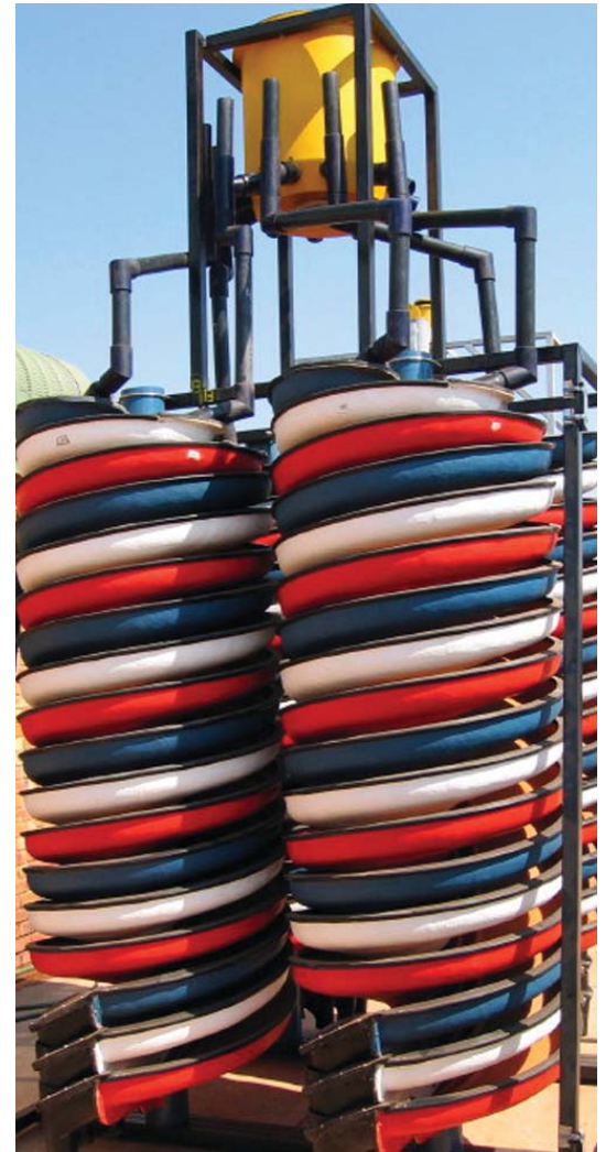
Bank of CS2000 Spirals

The CS2000 model spiral is a wide-bodied, washwaterless fiberglass/urethane spiral for coal cleaning and special mineral applications involving shape separation. This unit is available in 1, 2 and 3- start configurations utilizing between 4 and 6 turns depending on the application.