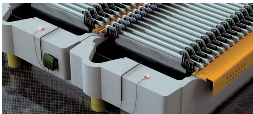
CellSensor™ installed at a refinery.

In this way users can easily view the tank house status, for instance from their offices or control rooms. CellSense™ can also process and store the history of each cell status during a full production cycle, presenting different views of tank house status by section, circulation system or operating crew.