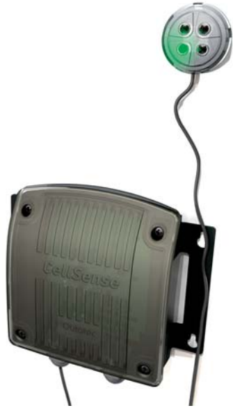
Outotec's CellSensor™ device.

Outotec and Kennecott's innovative CellSensor™ system is a powerful data collection system, based on robust wireless communication and powered by the cell bus bar voltage. Because there is no complex hard-wiring, isolators, power supplies or traditional instrumentation, the system not only overcomes many problems associated with maintenance and utilization of traditional hard-wired monitoring systems, but is free from normal maintenance requirements such as calibration and management of corrosion and cables. Also, the installation of the system is simplified.