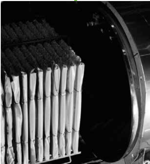
OUTOTEC LAROX® LSF