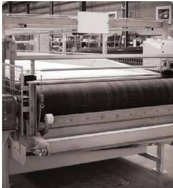
OUTOTEC LAROX® RT/RB