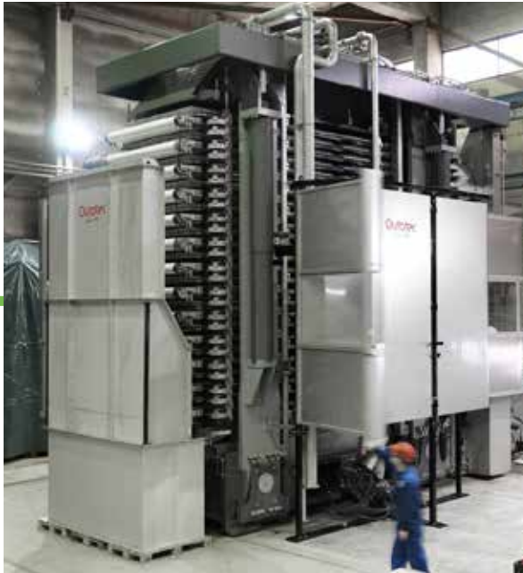
OUTOTEC LAROX® PF