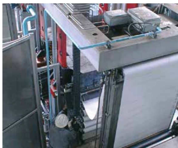
The PF Expansions are available for all PF models.